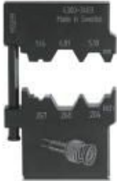
Die, for CRIMPFOX-M, for coaxial connectors

Please be informed that the data shown in this PDF Document is generated from our Online Catalog. Please find the complete data in the user's documentation. Our General Terms of Use for Downloads are valid ( http://phoenixcontact.com/download )