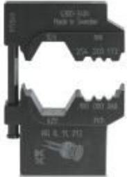
Die, for CRIMPFOX-M, for coaxial connectors

Please be informed that the data shown in this PDF Document is generated from our Online Catalog. Please find the complete data in the user's documentation. Our General Terms of Use for Downloads are valid ( http://phoenixcontact.com/download )