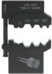
Die, for CRIMPFOX-M, for coaxial connectors

Please be informed that the data shown in this PDF Document is generated from our Online Catalog. Please find the complete data in the user's documentation. Our General Terms of Use for Downloads are valid ( http://phoenixcontact.com/download )