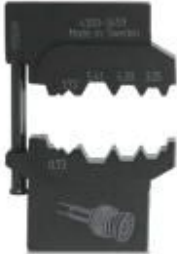
Die, for CRIMPFOX-M, for coaxial connectors

Please be informed that the data shown in this PDF Document is generated from our Online Catalog. Please find the complete data in the user's documentation. Our General Terms of Use for Downloads are valid ( http://phoenixcontact.com/download )