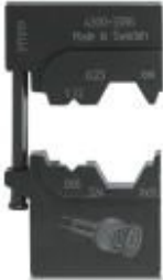
Die, for CRIMPFOX-M, for coaxial connectors

Please be informed that the data shown in this PDF Document is generated from our Online Catalog. Please find the complete data in the user's documentation. Our General Terms of Use for Downloads are valid ( http://phoenixcontact.com/download )