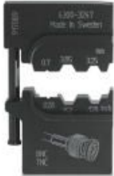
Die, for CRIMPFOX-M, for coaxial connectors

Please be informed that the data shown in this PDF Document is generated from our Online Catalog. Please find the complete data in the user's documentation. Our General Terms of Use for Downloads are valid ( http://phoenixcontact.com/download )