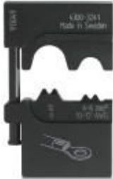
Die, for CRIMPFOX-M, for uninsulated cable lugs

Please be informed that the data shown in this PDF Document is generated from our Online Catalog. Please find the complete data in the user's documentation. Our General Terms of Use for Downloads are valid ( http://phoenixcontact.com/download )