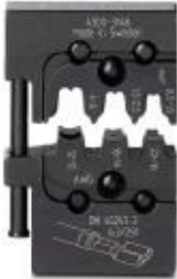
Die, for CRIMPFOX-M, for uninsulated slip-on sleeves

Please be informed that the data shown in this PDF Document is generated from our Online Catalog. Please find the complete data in the user's documentation. Our General Terms of Use for Downloads are valid ( http://phoenixcontact.com/download )