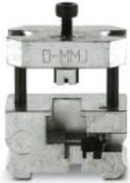
10-pos. replacement die

Please be informed that the data shown in this PDF Document is generated from our Online Catalog. Please find the complete data in the user's documentation. Our General Terms of Use for Downloads are valid ( http://phoenixcontact.com/download )