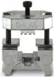
Die, for unshielded RJ45 plugs

Please be informed that the data shown in this PDF Document is generated from our Online Catalog. Please find the complete data in the user's documentation. Our General Terms of Use for Downloads are valid ( http://phoenixcontact.com/download )