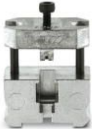
Die, for unshielded RJ-22 plugs

Please be informed that the data shown in this PDF Document is generated from our Online Catalog. Please find the complete data in the user's documentation. Our General Terms of Use for Downloads are valid ( http://phoenixcontact.com/download )