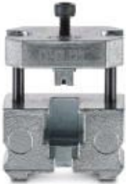
Die, for unshielded RJ11 plugs

Please be informed that the data shown in this PDF Document is generated from our Online Catalog. Please find the complete data in the user's documentation. Our General Terms of Use for Downloads are valid ( http://phoenixcontact.com/download )