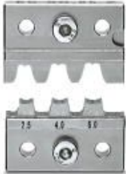
Die for CF 500 crimping machine, for solar contacts, 2.5 mm 2 , 4 mm 2 , 6 mm 2

Please be informed that the data shown in this PDF Document is generated from our Online Catalog. Please find the complete data in the user's documentation. Our General Terms of Use for Downloads are valid ( http://phoenixcontact.com/download )