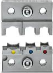
Die for crimping machine CF 500, for insulated cable lugs (C ... RCI... and C ... FCI...) 0.5 ... 6 mm 2

Please be informed that the data shown in this PDF Document is generated from our Online Catalog. Please find the complete data in the user's documentation. Our General Terms of Use for Downloads are valid ( http://phoenixcontact.com/download )