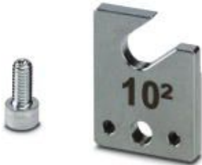
Accessories for CF 1000-10 stripping and crimping device, separation plate for 10.0 mm 2 sleeves

Please be informed that the data shown in this PDF Document is generated from our Online Catalog. Please find the complete data in the user's documentation. Our General Terms of Use for Downloads are valid ( http://phoenixcontact.com/download )