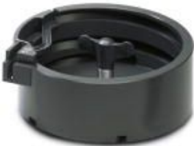
The figure shows the CF 1000 SORT4,0 version

Accessories for CF 1000-10 stripping and crimping machine, feeder bowl for 10.0 mm 2 sleeves