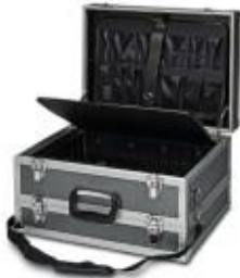
Tool case, unequipped, hard case, two levels

Please be informed that the data shown in this PDF Document is generated from our Online Catalog. Please find the complete data in the user's documentation. Our General Terms of Use for Downloads are valid ( http://phoenixcontact.com/download )