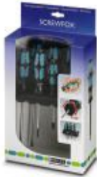
Screwdriver set, bladed/crosshead Pozidriv®, 6-part, incl. rack

Please be informed that the data shown in this PDF Document is generated from our Online Catalog. Please find the complete data in the user's documentation. Our General Terms of Use for Downloads are valid ( http://phoenixcontact.com/download )