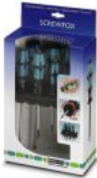
Screwdriver set, bladed/crosshead Phillips Recess ® , 6-part, incl. rack

Please be informed that the data shown in this PDF Document is generated from our Online Catalog. Please find the complete data in the user's documentation. Our General Terms of Use for Downloads are valid ( http://phoenixcontact.com/download )