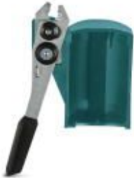
Cutting unit, for CF CRIMPHANDY, for stranded copper wires from 0.5 - 1.5 mm 2 , incl. receptacle tray

Please be informed that the data shown in this PDF Document is generated from our Online Catalog. Please find the complete data in the user's documentation. Our General Terms of Use for Downloads are valid ( http://phoenixcontact.com/download )