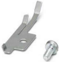
Waste guide plate 1, for CF CRIMPHANDY 0,5 /0,75 /1,0/1,5

Please be informed that the data shown in this PDF Document is generated from our Online Catalog. Please find the complete data in the user's documentation. Our General Terms of Use for Downloads are valid ( http://phoenixcontact.com/download )