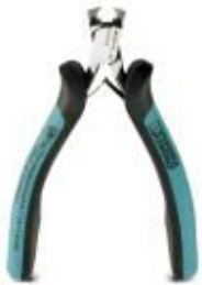
Electronic front cutter, 20° angle, without chamfer, with opening spring

Please be informed that the data shown in this PDF Document is generated from our Online Catalog. Please find the complete data in the user's documentation. Our General Terms of Use for Downloads are valid ( http://phoenixcontact.com/download )