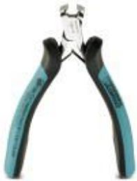
Electronic front cutter, without chamfer, with opening spring

Please be informed that the data shown in this PDF Document is generated from our Online Catalog. Please find the complete data in the user's documentation. Our General Terms of Use for Downloads are valid ( http://phoenixcontact.com/download )