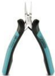
Electronic flat pliers, smooth gripping surface, with spring opening

Please be informed that the data shown in this PDF Document is generated from our Online Catalog. Please find the complete data in the user's documentation. Our General Terms of Use for Downloads are valid ( http://phoenixcontact.com/download )