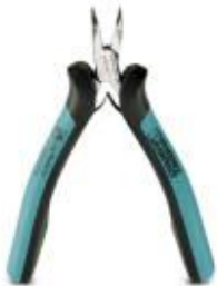
Electronic needle-nose pliers, 45° angle, smooth grip, with opening spring

Please be informed that the data shown in this PDF Document is generated from our Online Catalog. Please find the complete data in the user's documentation. Our General Terms of Use for Downloads are valid ( http://phoenixcontact.com/download )