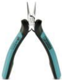
Electronic needle-nose pliers, smooth grip, with opening spring

Please be informed that the data shown in this PDF Document is generated from our Online Catalog. Please find the complete data in the user's documentation. Our General Terms of Use for Downloads are valid ( http://phoenixcontact.com/download )