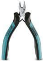
Electronic diagonal cutter, tapered head, angled (21°), without chamfer, with opening spring

Please be informed that the data shown in this PDF Document is generated from our Online Catalog. Please find the complete data in the user's documentation. Our General Terms of Use for Downloads are valid ( http://phoenixcontact.com/download )