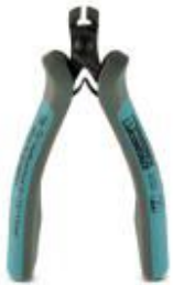
ESD electronic front cutter, without chamfer, with opening spring

Please be informed that the data shown in this PDF Document is generated from our Online Catalog. Please find the complete data in the user's documentation. Our General Terms of Use for Downloads are valid ( http://phoenixcontact.com/download )