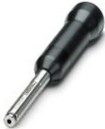
Rivet setting tool, for use with RVT-PA 4 plastic body-bound rivets

Please be informed that the data shown in this PDF Document is generated from our Online Catalog. Please find the complete data in the user's documentation. Our General Terms of Use for Downloads are valid ( http://phoenixcontact.com/download )