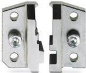
CF 500 die, for plug-in bridges (FBS... 4,5,6 and 8) for easy retrieval of individual jumper bars

Please be informed that the data shown in this PDF Document is generated from our Online Catalog. Please find the complete data in the user's documentation. Our General Terms of Use for Downloads are valid ( http://phoenixcontact.com/download )