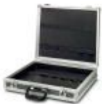
Toolbox, without instruments, with rubber straps as tool fixtures