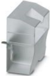
Waste holder for stripping machine

Please be informed that the data shown in this PDF Document is generated from our Online Catalog. Please find the complete data in the user's documentation. Our General Terms of Use for Downloads are valid ( http://phoenixcontact.com/download )