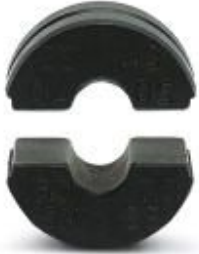
pre-round die (pair), for CRIMPFOX-C50, for sector cable 50 + 70 mm 2

Please be informed that the data shown in this PDF Document is generated from our Online Catalog. Please find the complete data in the user's documentation. Our General Terms of Use for Downloads are valid ( http://phoenixcontact.com/download )