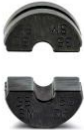
pre-round die (pair), for CRIMPFOX-C50, for sector cable 35 + 50 mm 2

Please be informed that the data shown in this PDF Document is generated from our Online Catalog. Please find the complete data in the user's documentation. Our General Terms of Use for Downloads are valid ( http://phoenixcontact.com/download )