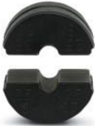
pre-round die (pair), for CRIMPFOX-C50, for sector cable 25 + 35 mm 2

Please be informed that the data shown in this PDF Document is generated from our Online Catalog. Please find the complete data in the user's documentation. Our General Terms of Use for Downloads are valid ( http://phoenixcontact.com/download )