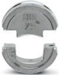
Die (pair), for CRIMPFOX-C50, for insulated ring cable lug 25 mm 2 , oval crimp

Please be informed that the data shown in this PDF Document is generated from our Online Catalog. Please find the complete data in the user's documentation. Our General Terms of Use for Downloads are valid ( http://phoenixcontact.com/download )