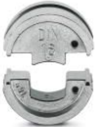
Die (pair), for CRIMPFOX-C50, for insulated ring cable lug 16 mm 2 , oval crimp

Please be informed that the data shown in this PDF Document is generated from our Online Catalog. Please find the complete data in the user's documentation. Our General Terms of Use for Downloads are valid ( http://phoenixcontact.com/download )