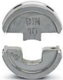
Die (pair), for CRIMPFOX-C50, for insulated ring cable lug 10 mm 2 , oval crimp

Please be informed that the data shown in this PDF Document is generated from our Online Catalog. Please find the complete data in the user's documentation. Our General Terms of Use for Downloads are valid ( http://phoenixcontact.com/download )