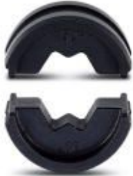
Die (pair), for CRIMPFOX-C50, for copper tube lug 35 mm 2 , WM crimp

Please be informed that the data shown in this PDF Document is generated from our Online Catalog. Please find the complete data in the user's documentation. Our General Terms of Use for Downloads are valid ( http://phoenixcontact.com/download )