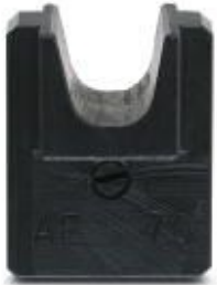
Die (lower part), for CRIMPFOX-C120, for ferrules (DIN 46228) 70 mm 2 , trapeze crimp

Please be informed that the data shown in this PDF Document is generated from our Online Catalog. Please find the complete data in the user's documentation. Our General Terms of Use for Downloads are valid ( http://phoenixcontact.com/download )