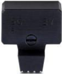
Die (upper part), for CRIMPFOX-C120, for ferrules (DIN 46228) 95 mm 2 , trapeze crimp

Please be informed that the data shown in this PDF Document is generated from our Online Catalog. Please find the complete data in the user's documentation. Our General Terms of Use for Downloads are valid ( http://phoenixcontact.com/download )