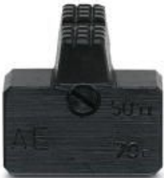
Die (upper part), for CRIMPFOX-C120, for ferrules (DIN 46228) 70 mm 2 , trapeze crimp

Please be informed that the data shown in this PDF Document is generated from our Online Catalog. Please find the complete data in the user's documentation. Our General Terms of Use for Downloads are valid ( http://phoenixcontact.com/download )