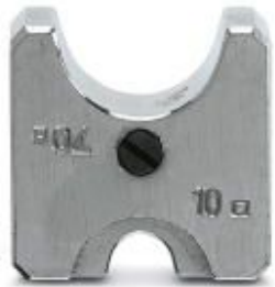
Die (lower part), for CRIMPFOX-C120, for non-insulated cable lugs (DIN 46234) 10 + 70 mm 2 , indent crimp

Please be informed that the data shown in this PDF Document is generated from our Online Catalog. Please find the complete data in the user's documentation. Our General Terms of Use for Downloads are valid ( http://phoenixcontact.com/download )