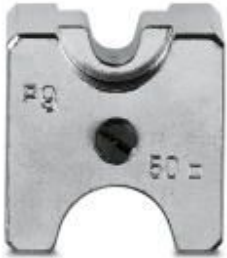
Die (lower part), for CRIMPFOX-C120, for non-insulated cable lugs (DIN 46234) 6 + 50 mm 2 , indent crimp

Please be informed that the data shown in this PDF Document is generated from our Online Catalog. Please find the complete data in the user's documentation. Our General Terms of Use for Downloads are valid ( http://phoenixcontact.com/download )