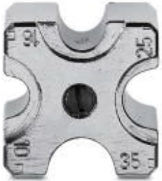
Die (lower part), for CRIMPFOX-C120, for non-insulated cable lugs (DIN 46234) 10 + 16 +25 + 35 mm 2 , indent crimp

Please be informed that the data shown in this PDF Document is generated from our Online Catalog. Please find the complete data in the user's documentation. Our General Terms of Use for Downloads are valid ( http://phoenixcontact.com/download )