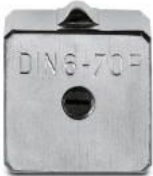
Die (upper part), for CRIMPFOX-C120, for non-insulated cable lugs (DIN 46234) 6 ... 70 mm 2 , indent crimp

Please be informed that the data shown in this PDF Document is generated from our Online Catalog. Please find the complete data in the user's documentation. Our General Terms of Use for Downloads are valid ( http://phoenixcontact.com/download )