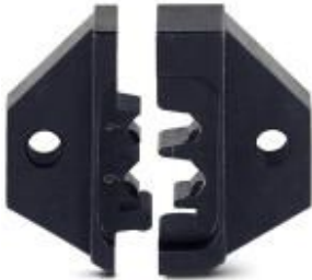
Spare die for CRIMPFOX-TC 6

Please be informed that the data shown in this PDF Document is generated from our Online Catalog. Please find the complete data in the user's documentation. Our General Terms of Use for Downloads are valid ( http://phoenixcontact.com/download )