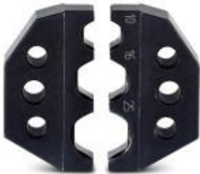
Spare die for CRIMPFOX-RCT 25-1

Please be informed that the data shown in this PDF Document is generated from our Online Catalog. Please find the complete data in the user's documentation. Our General Terms of Use for Downloads are valid ( http://phoenixcontact.com/download )