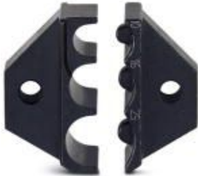
Spare die for CRIMPFOX-RC 25

Please be informed that the data shown in this PDF Document is generated from our Online Catalog. Please find the complete data in the user's documentation. Our General Terms of Use for Downloads are valid ( http://phoenixcontact.com/download )