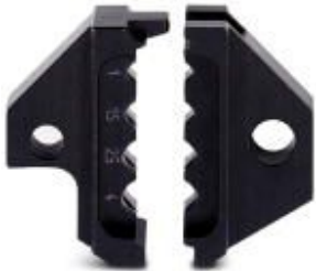
Spare die for CRIMPFOX-TC 4

Please be informed that the data shown in this PDF Document is generated from our Online Catalog. Please find the complete data in the user's documentation. Our General Terms of Use for Downloads are valid ( http://phoenixcontact.com/download )